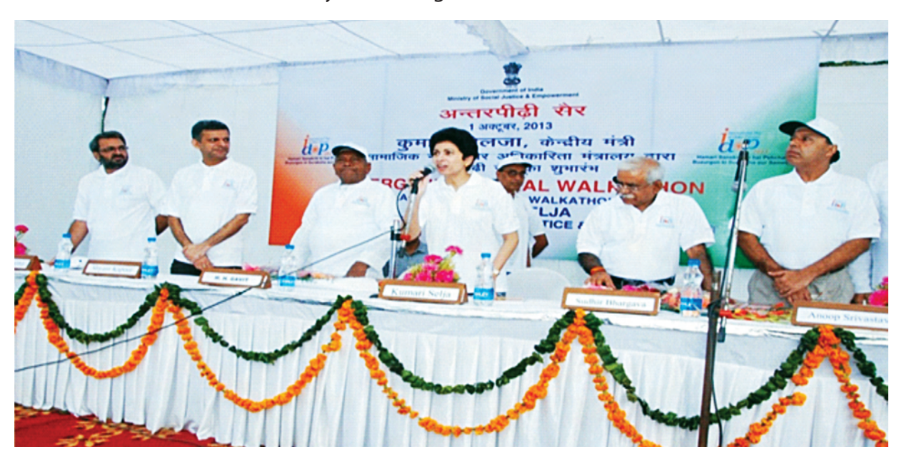
Minister of Social Justice & Empowerment, Kumari Selja addressing the Inter-Generational Walkathon at India Gate on 1st October 2013

Ministry of Social Justice and Empowerment being the nodal Ministry for the welfare of senior citizens observed the International Day of Older Persons on 1st October, 2013 at the national level with a series of programmes which include organizing an inter-generational walkathon at the India Gate lawns, New Delhi, and felicitating "Vayoshrestha Sammans" – National Award for Senior Citizens under different categories by the Hon'ble President of India later. State Governments were also requested to observe this occasion in befitting manner right up to the Block levels. On 1st October 2013, the Ministry also organised similar Walkathons in 9 States in collaboration with Help Age India, namely, Assam (Guwahati), Gujarat (Ahmadabad), Himachal Pradesh (Shimla & Solan), Kerala (Kochi), Madhya Pradesh (Bhopal), Maharashtra (Mumbai), Odisha (Bhubaneswar), Rajasthan (Jaipur) and Tamil Nadu (Chennai), and the Union Territory of Chandigarh.