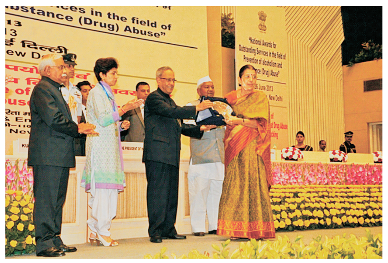
Shri Pranab Mukherjee, Hon'ble President of India, conferring National Award to an awardee during the Function. Kumari Selja, Hon'ble Minister of Social Justice and Empowerment, Shri M H Gavit, Minister of State for Social Justice and Empowerment and Shri Sudhir Bharqava, Secretary, Department of SJ&E are on the Dias.