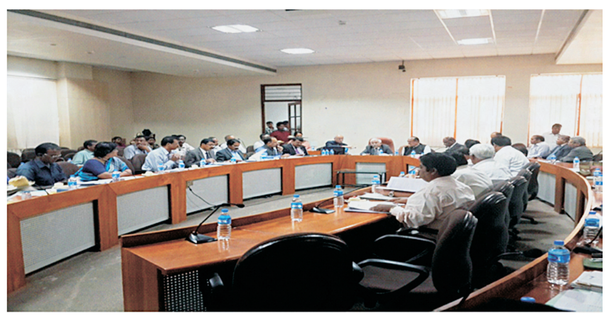
A meeting was held under the chairmanship of Secretary, with the Pr. Secretaries/Secretaries of the Government of Karnataka to review the action taken for implementation of the 'Prohibition of Employment as Manual Scavengers and their Rehabilitation Act, 2013'